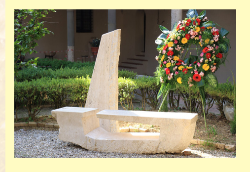
Travertine marble bench in memory Fr Brian Lowery OSA