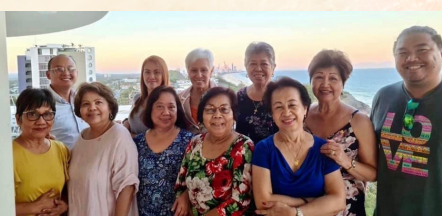
Gold Coast Friends

"We would teach and learn from each other, sadly missing any who were absent and blithely welcoming them when they returned. Such signs of friendship sprang from the hearts of friends who love and knew their love returned, signs to be read in smiles, words, glances and a thousand gracious gestures. So were sparks kindled and our minds were fused inseparably, out of many becoming one."