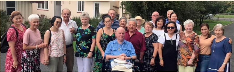
Gathering of Friends from Mareeba, Cairns & Brisbane