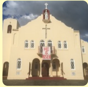
St Thomas' of Villanova Mareeba