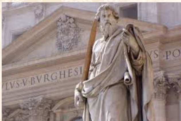
Statue of St Paul, Vatican City