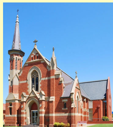
St Augustine's Church Kyabram, Vic