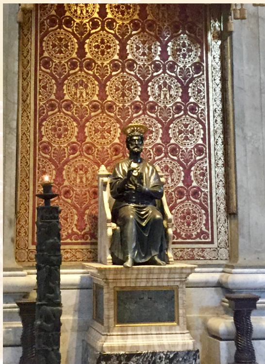
Statue of St Peter St Peter's Basilica Vatican City

Sermon 295, 1-2, 4, 7-8; PL 38, 1348-1352)