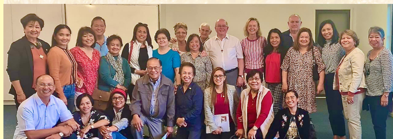
Gold Coast gathering May 2021