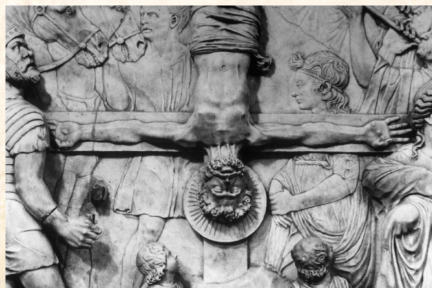
Stone carving depicting St Peter's crucifixion, St Peter's Basilica